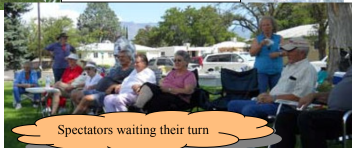
Spectators waiting their turn