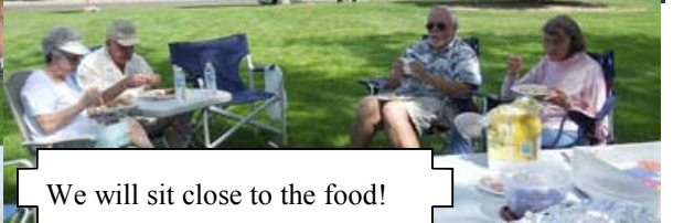
We will sit close to the food!